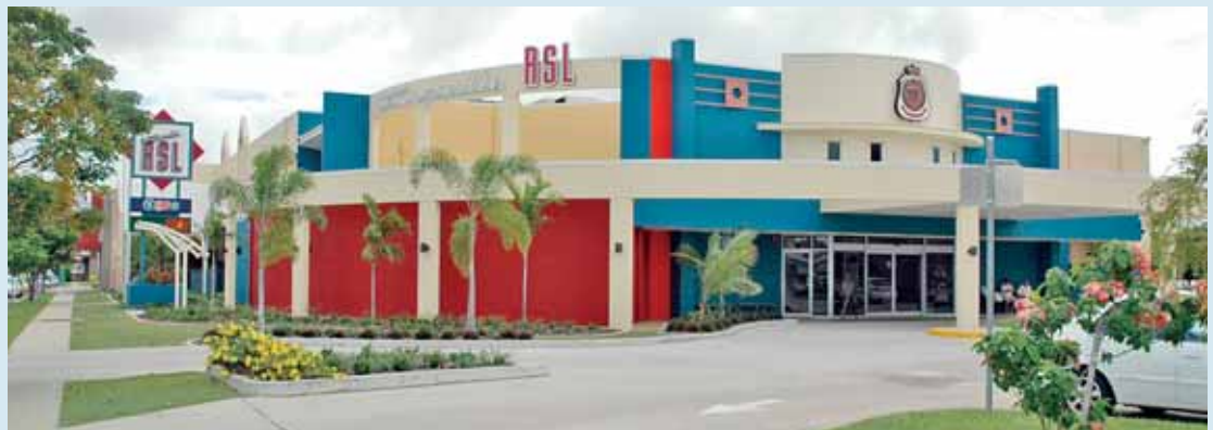
The RSL in Townsville.

façade, rock anchored basement, post tensioned suspended slabs to make the project viable.