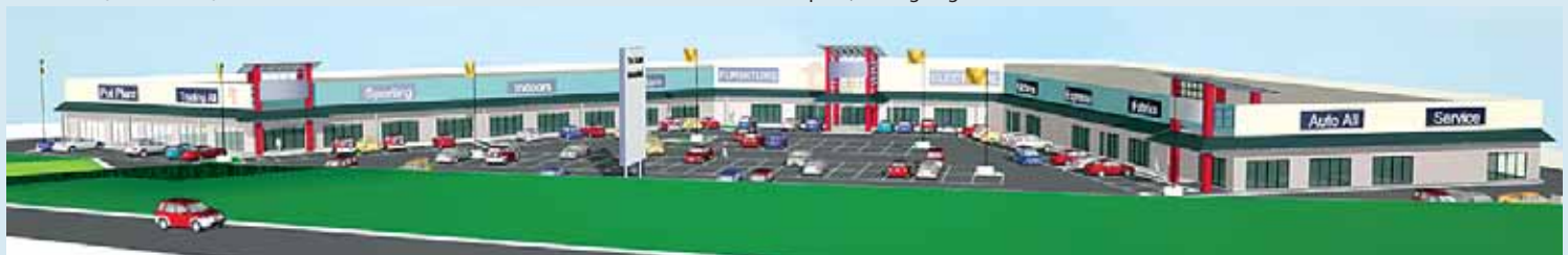
Morayfield bulky goods shopping precinct consisting of eight tenancies, car park and external road works.