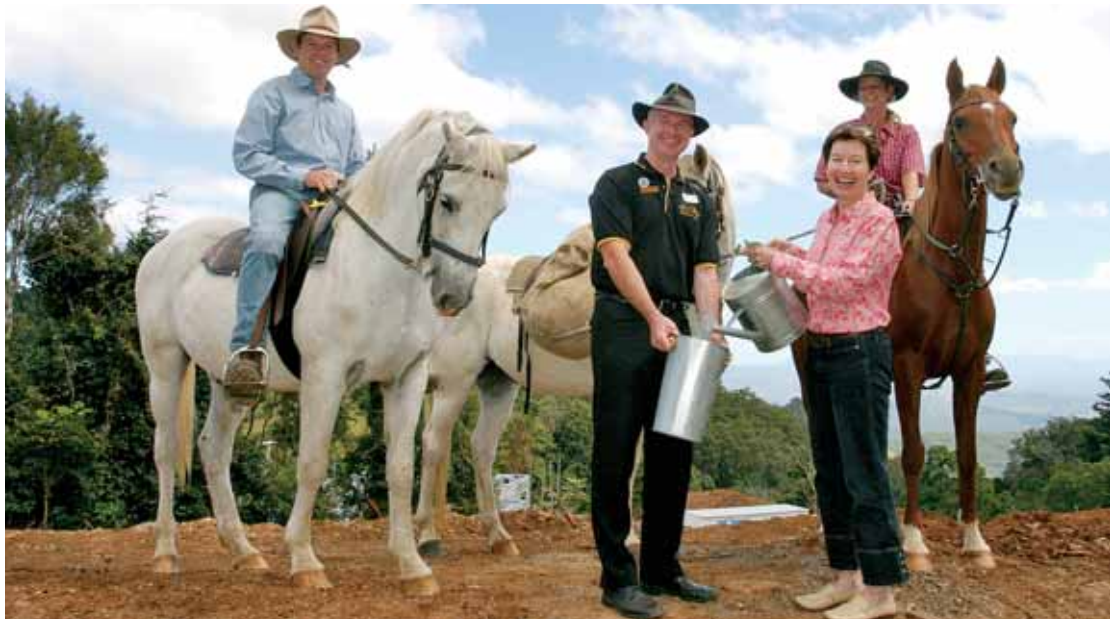
A seed from the rare Large Leaf Wonga Vine was planted and watered from nearby Moran's Creek, a fitting symbol of the unique eco-villas that will rise from the site of the O'Reilly's original dairy farm.