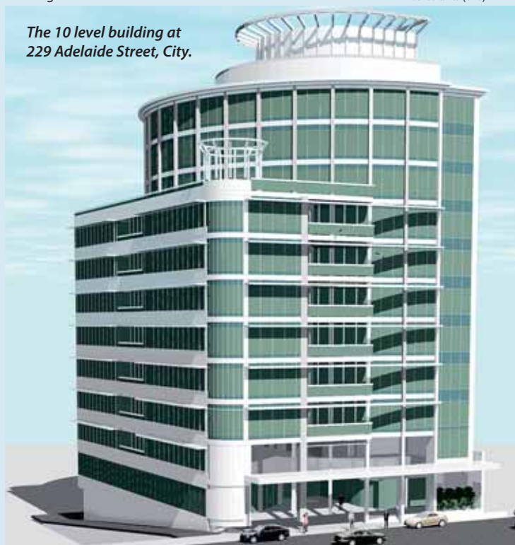
The 10 level building at 229 Adelaide Street, City.

Job Description: Expansion and upgrade to an existing shopping plaza including two building pads for fast food outlets, alteration works to an existing tavern, construction of a Liquor Barn, construction of two storey suspended deck car park and two large commercial retail centres.