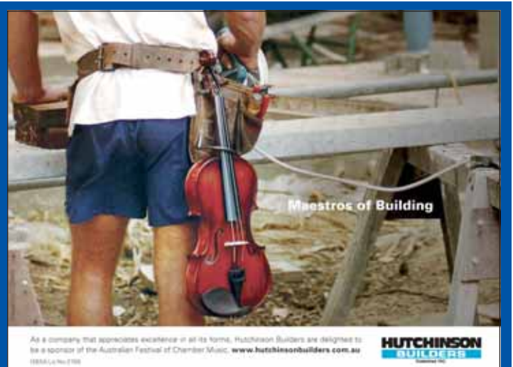
As a company that appreciates excellence in all its forms, Hutchinson Builders are delighted to be a sponsor of the Australian Festival of Chamber Music. www.hutchinsonbuilders.com.au

Hutchies also received The Professional Excellence Award for Straddie Domain Resort (North Stradbroke Island) and High Commendation Award for the Heron Island project.