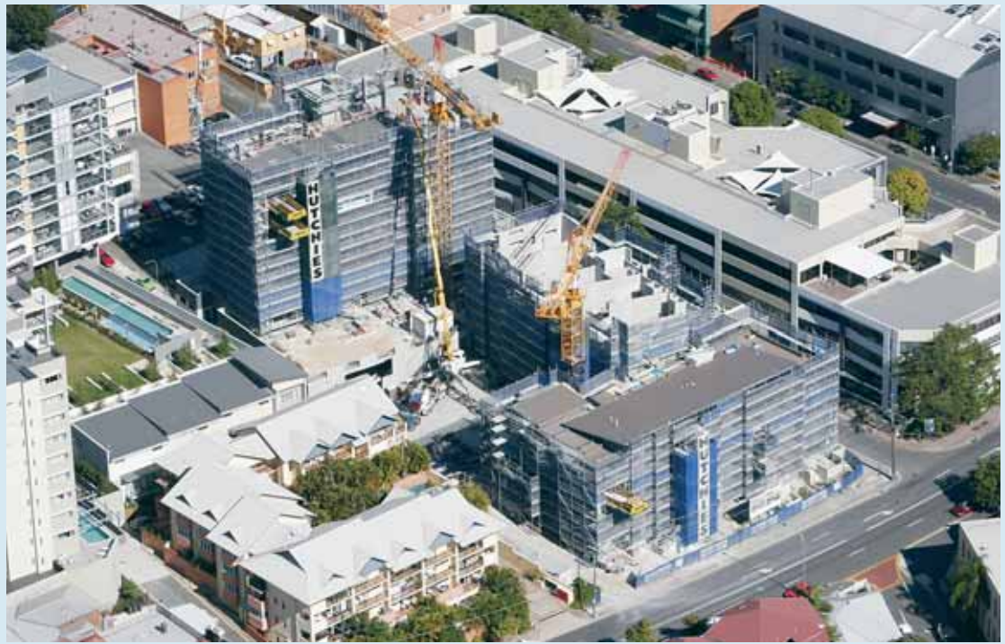
Trilogy Apartments Spring Hill. This is the second stage of the redevelopment of the old Metro Ford site.

Job Description: Trilogy is the first high-rise in Toowoomba for some years. It has 13 floors made up of two basement car parks, three commercial office levels and seven residential levels. Hutchies changed the project from a hard tender to a design and construct project and implemented some changes including precast tilt panel