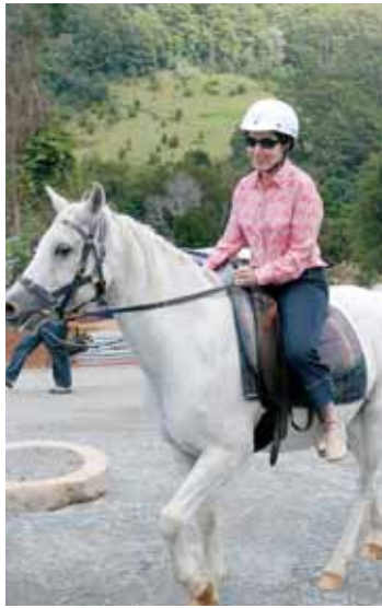
Queensland Tourism Minister Margaret Keach arrived on horseback for the launch of the $35 million Mountain Bowers development - just as the intrepid visitors to O'Reilly's did back in 1926 when the first guesthouse opened.

Mr O'Reilly said extensive planning had gone into ensuring eco-friendly, sustainable construction